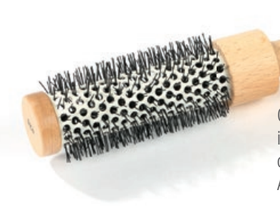
Ceramic tube with Nylon fibres inner diameter: 26mm, outer diameter: 38mm Article No. 75/38C 122