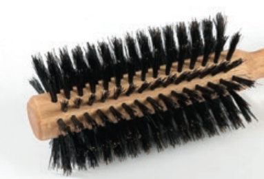
100% natural bristle, 70mm diameter Article No. 75/323 122