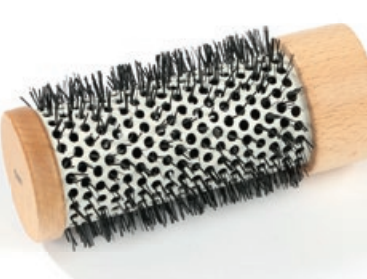
Ceramic tube with Nylon fibres inner diameter: 40mm, outer diameter: 55mm Article No. 75/40C 122