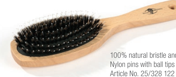
100% natural bristle and Nylon pins with ball tips