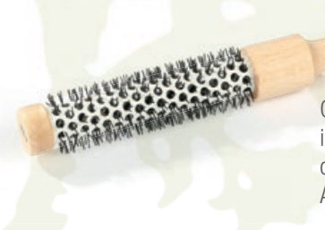
Ceramic tube with Nylon fibres inner diameter: 16mm, outer diameter: 25mm Article No. 75/37C 122