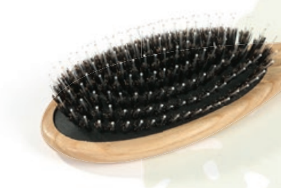
Brush with ash wood handle Real natural bristle and Nylon pins with ball tips Article No, 25/42 191