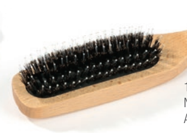
100% natural bristle and Nylon pins with ball tips Article No. 25/327 122